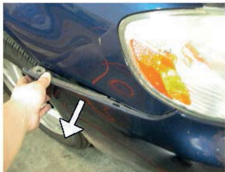
4. Before you remove the bumper, pull one side out first