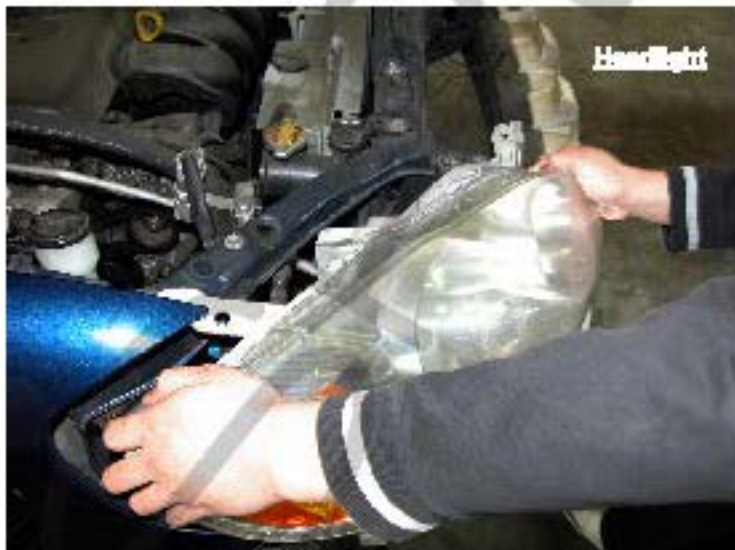
9. Pull out the headlights from the vehicle (BOTH SIDE)