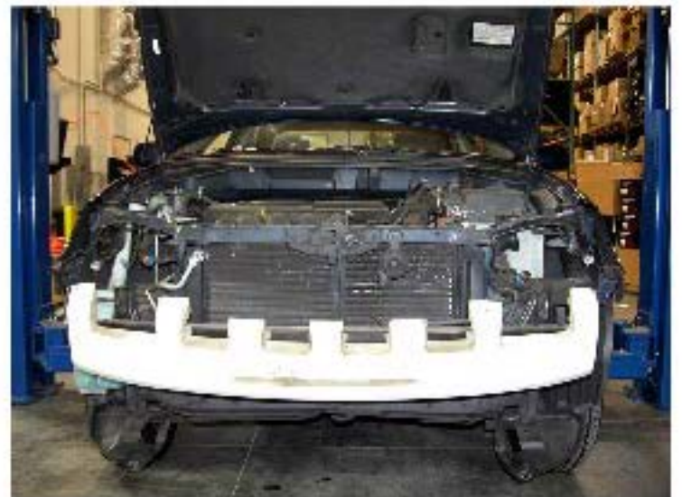
10. Now you can see the difference after removing the headlights and bumper