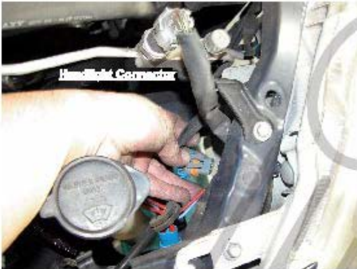
7. Remove the connectors from the headlight (BOTH SIDE)