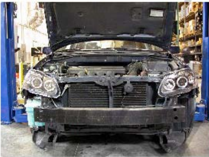
13. Installation is the reverse of the removal procedure

If your headlights don't have HALO or L.E.D. You can skip Step 12