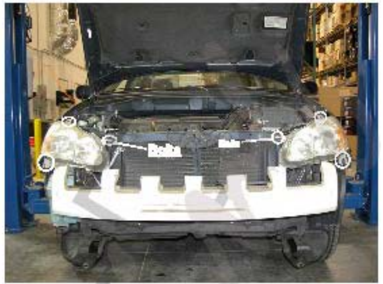
6. Remove the mounting bolts from headlights (BOTH SIDE)