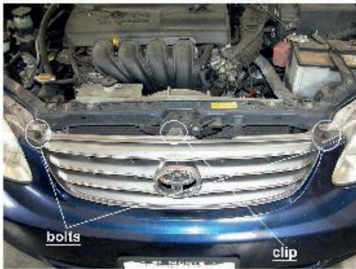
1. Remove the bolts and clip

If you experience any difficulties that the instruction did not cover, Please seek local auto shop for advise. Please wear protection before you work on your vehicle. An assistant is helpful when removing the front bumper. Please be careful while working with the bumper or body part to avoid scratching. Do not make direct contact with the halogen bulb or the wire assembly until the unit has cooled down after use.