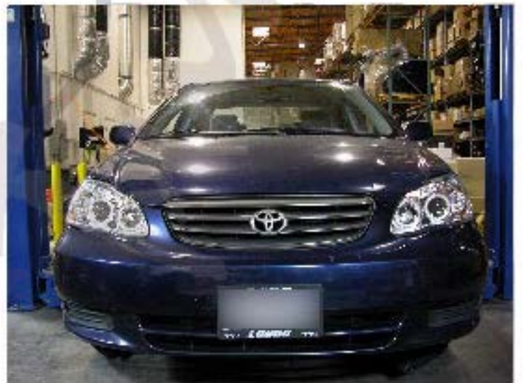
14. The installation now is complete