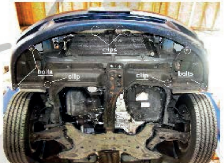
2. Remove the bolts and clips from the front bumper