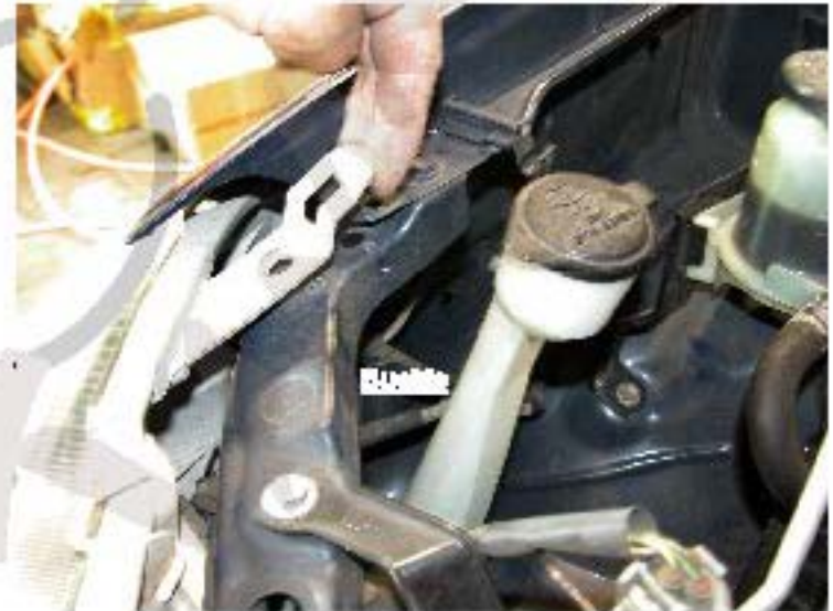
8. Pull up the buckle from the top of headlight (BOTH SIDE)