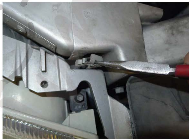
9. Remove the (2) metal clips