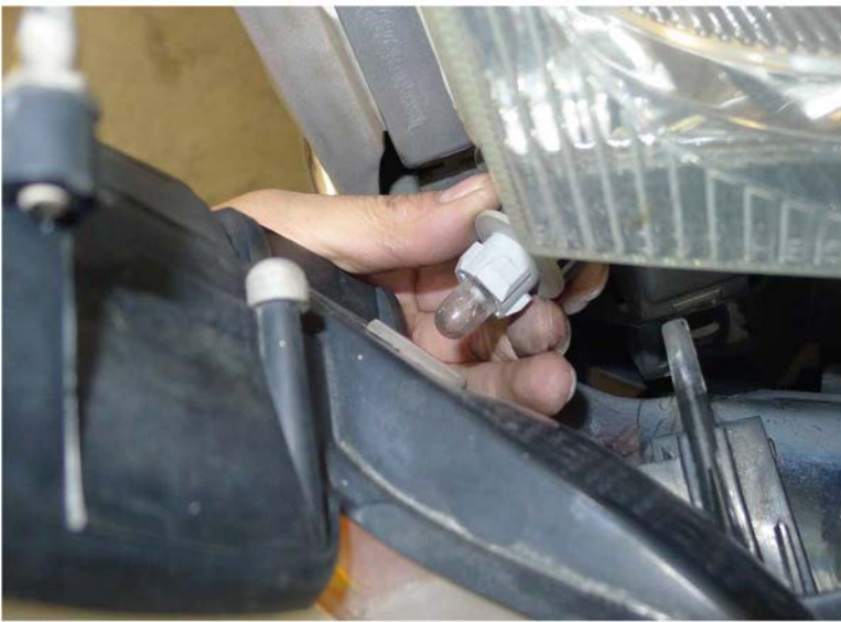
5. Remove the light socket