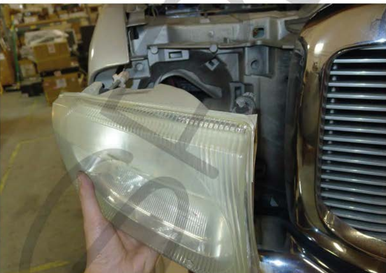
10. Remove the headlight