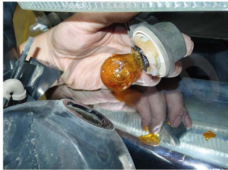
6. Remove the light socket