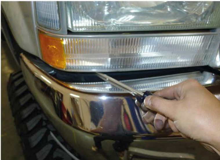
3. Remove the (2) phillips head screws