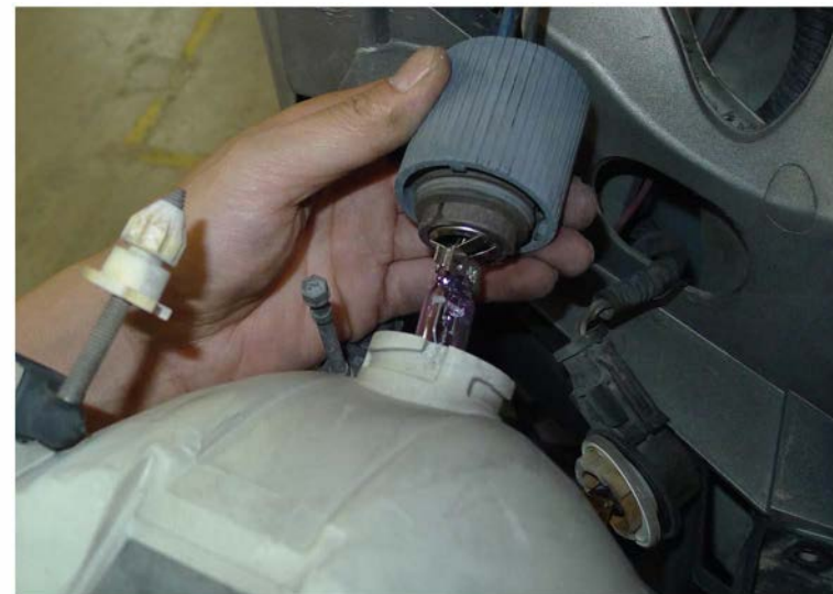
10. Remove the headlight bulb and harness