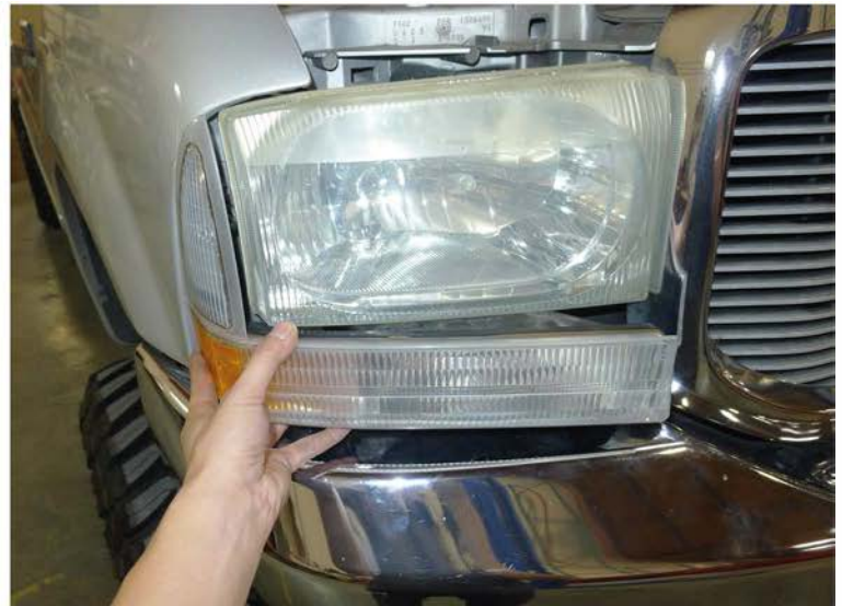
4. Remove the bumper corner light