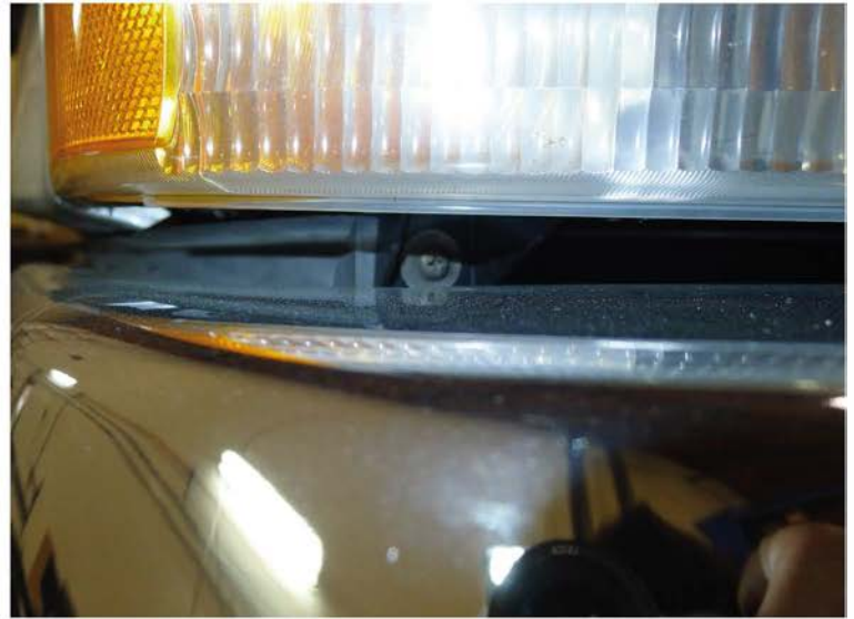
2. Phillips head screw location