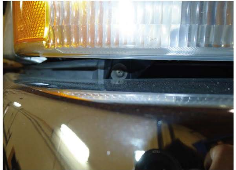
2. Phillips head screw location