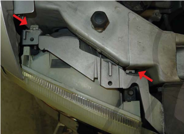
8. (2) metal retaining clip location