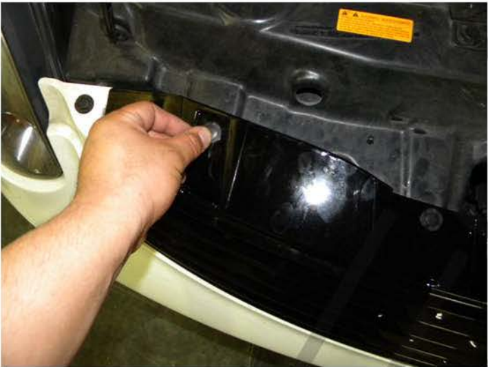
7. Install six clips