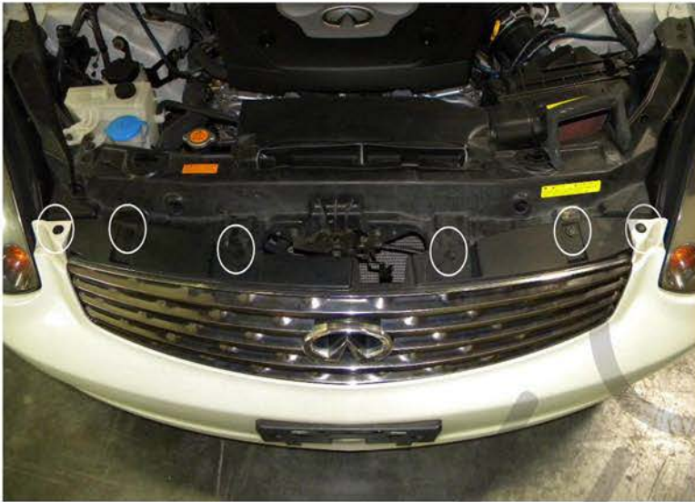
1. Remove six clips

If you experience any difficulties that the instruction did not cover, Please seek local auto shop for advise. Please wear protection before you work on your vehicle. An assistant is helpful when removing the front bumper. Please be careful while working with the bumper or body part to avoid scratching. Do not make direct contact with the halogen bulb or the wire assembly until the unit has cooled down after use.