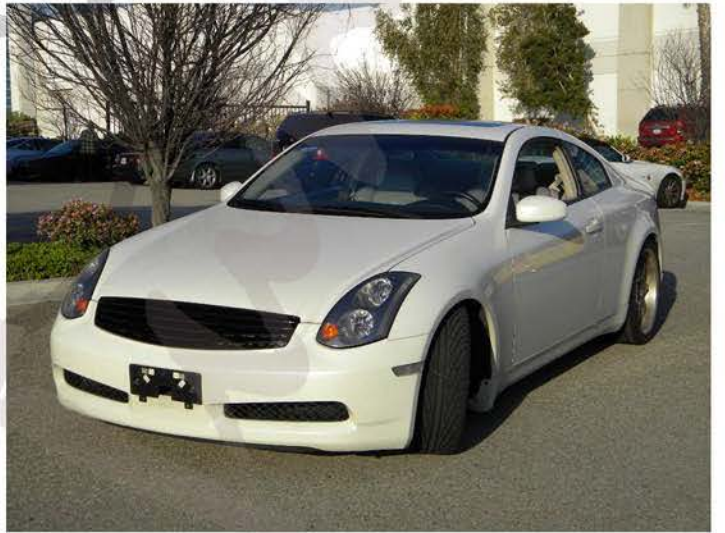
8. The installation is now complete