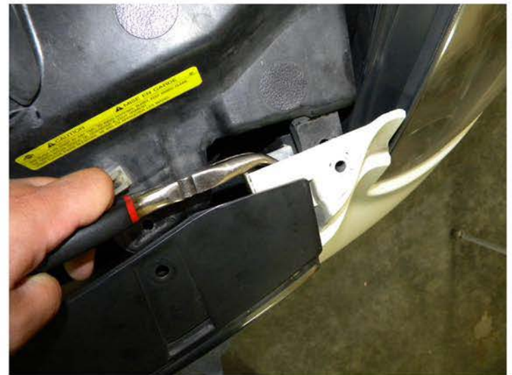
4. Unlock the one clip (Both side)