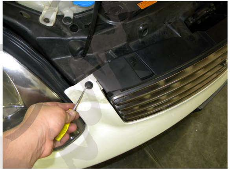
2. Remove the first clip from the left side (Both side)