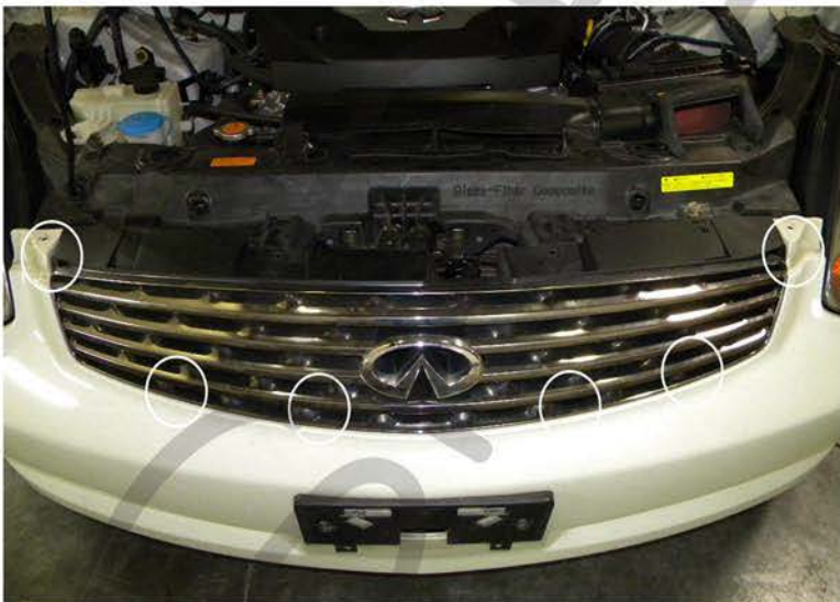
3. Unlock six clips from inside the front bumper