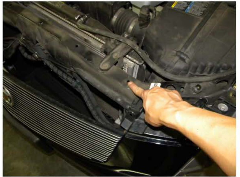
4. Remove the plastic clips on the top of the grill