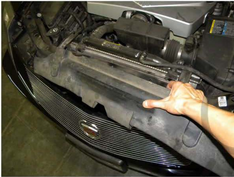
1. Remove the rubber guard

Do not make direct contact with the halogen bulbs or the wire assembly until the unit has cooled down after use.