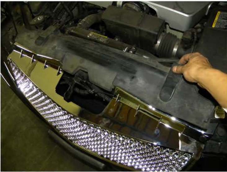
17. Replace the rubber guard