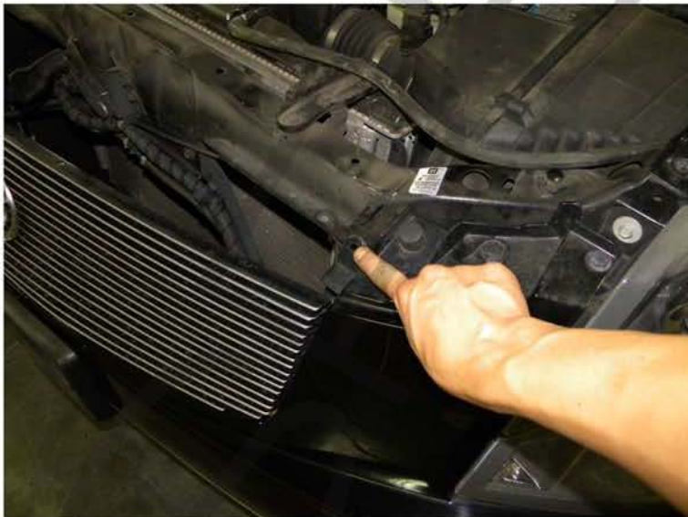
3. Remove the plastic clips on the top of the grill