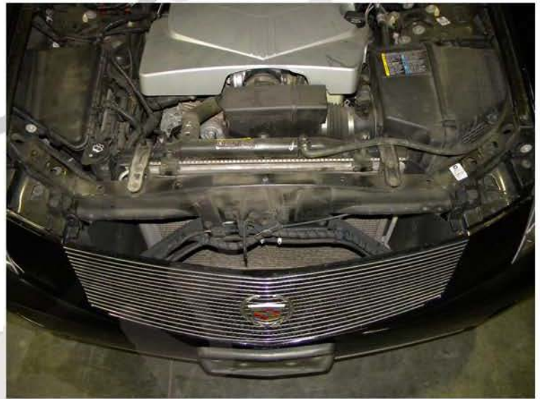
2. Plastic clip location