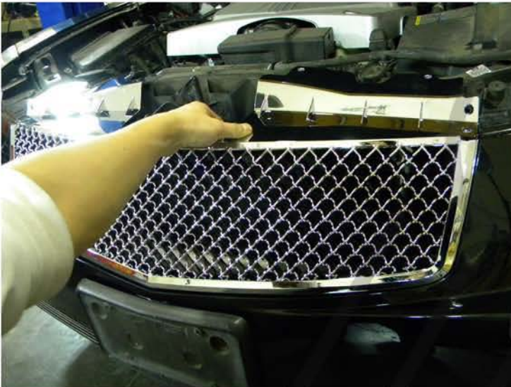
13. Place the new grill in the stock location