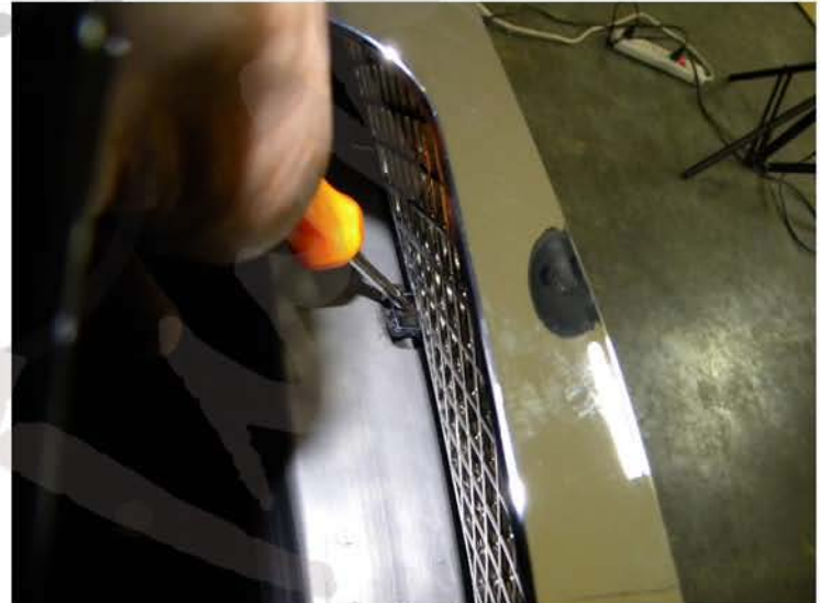
14. Replace and tighten the (8) phillips screws