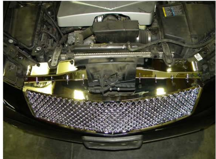
16. Plastic clips location