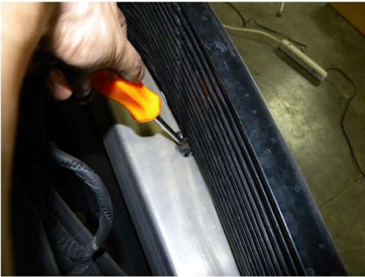
11. Remove the phillips head screws (8 total)