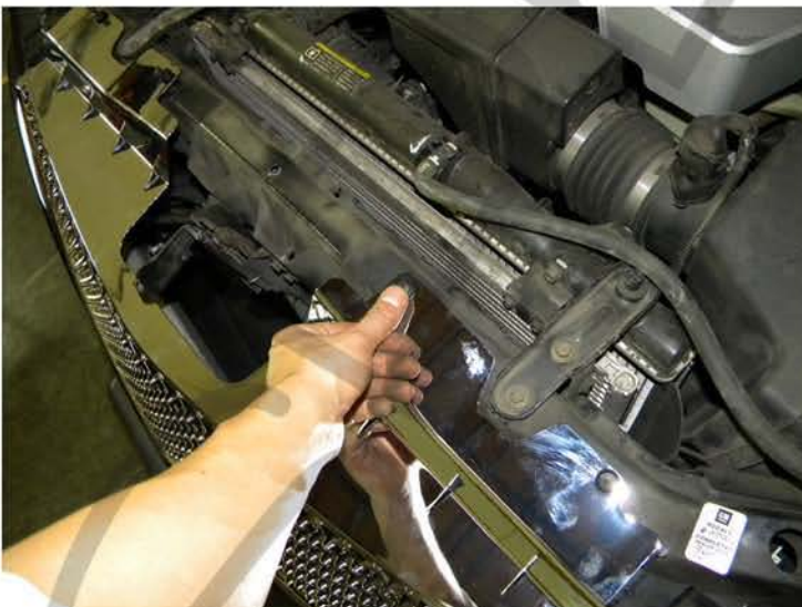
15. Place the (6) plastic clips on the top side of grill