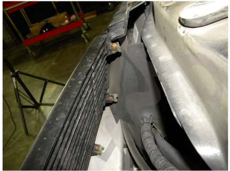
6. Phillips head screws location (8 total)