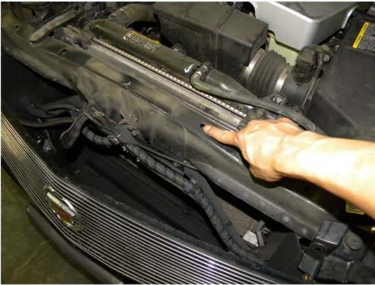
5. Remove the plastic clips on the top of the grill