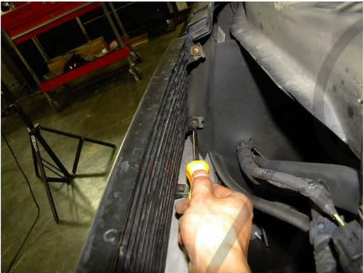
7. Remove the phillips head screws (8 total)