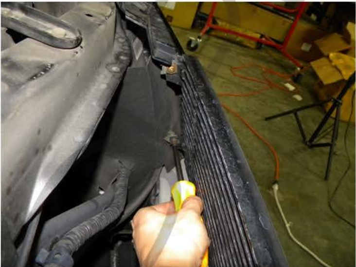
9. Remove the phillips head screws (8 total)