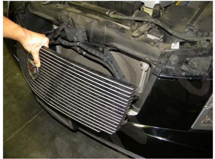
12. Remove the front grill