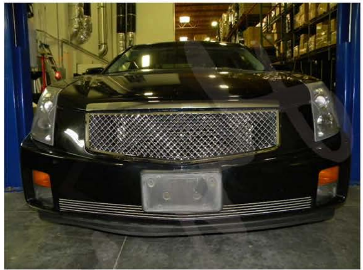
18. The installation is now complete