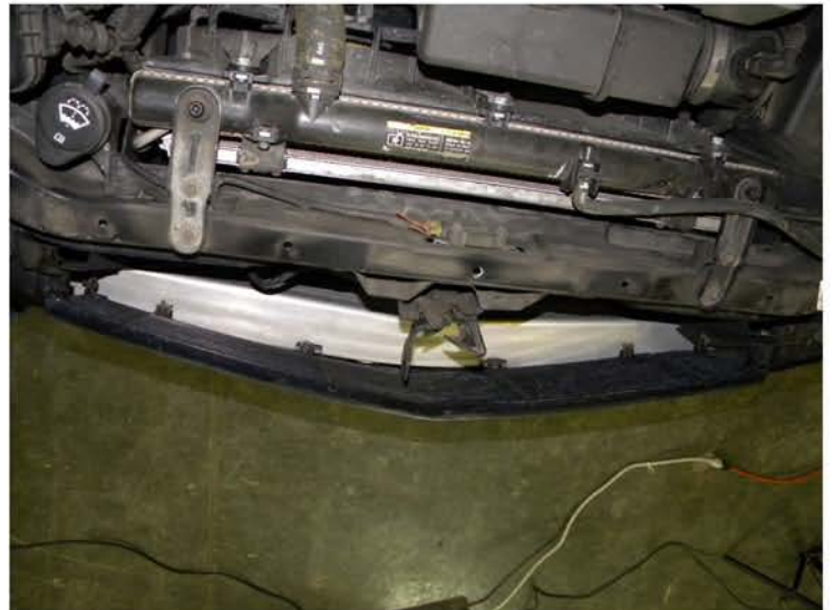
10. Phillips head screws location (8 total)