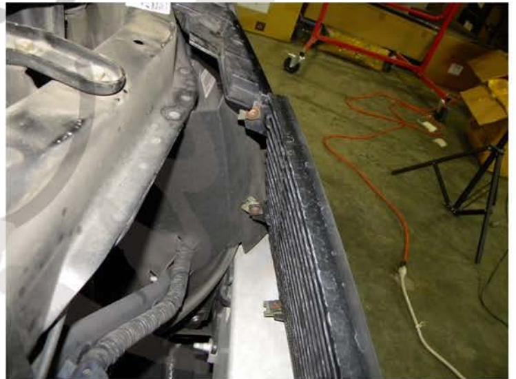
8. Phillips head screws location (8 total)