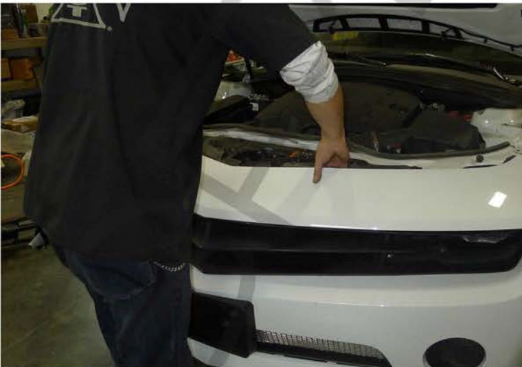
15. Remove the front bumper