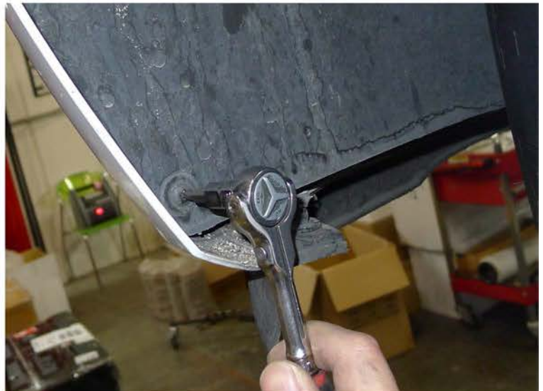
4. Remove the (3) T20 screws