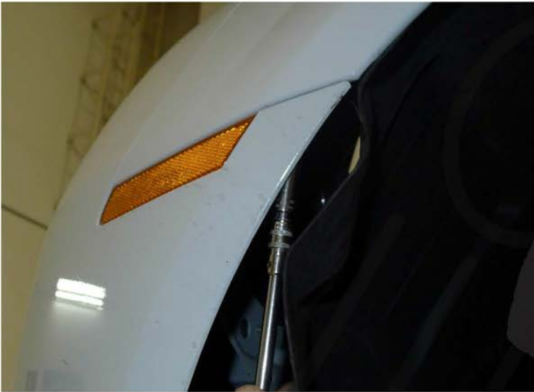
37. Tighten the 7mm bolt