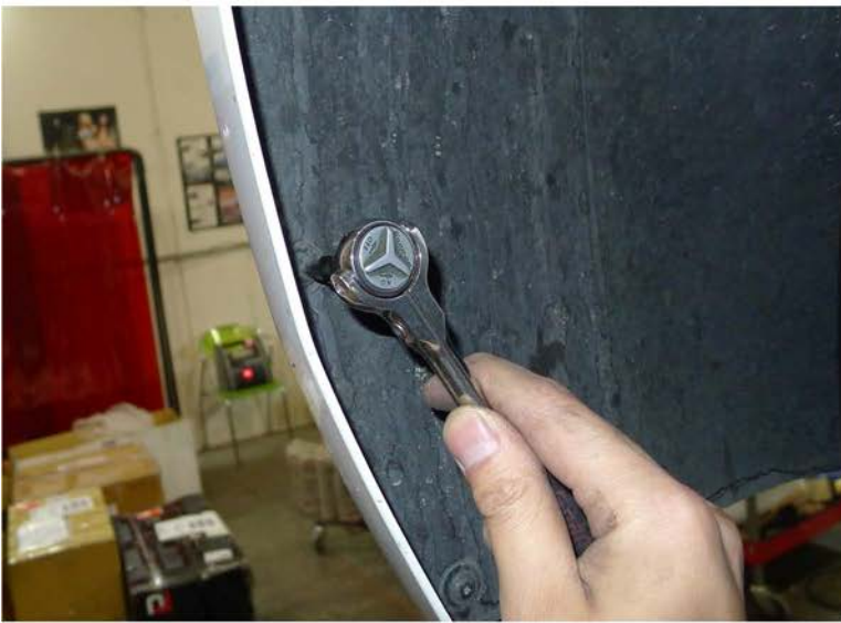
5. Remove the (3) T20 screws