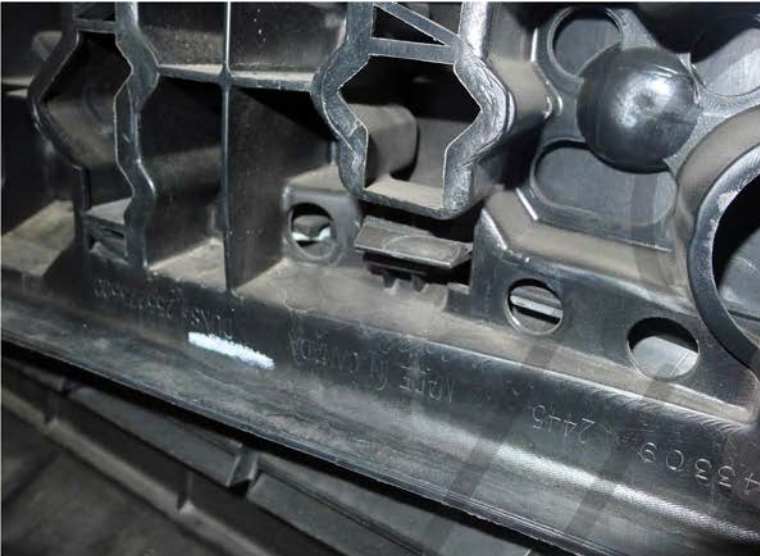
19. Plastic tabs location