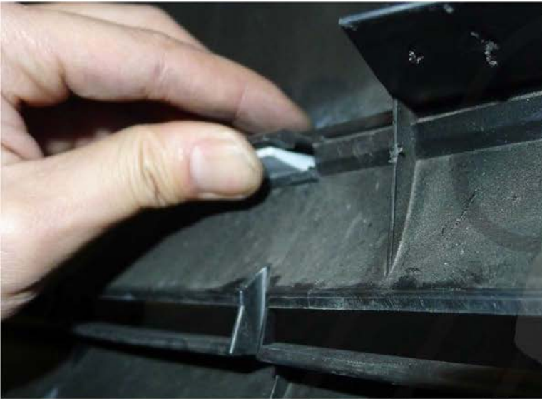
25. Release the mounting tabs