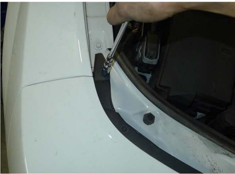
11. Remove the (2) 10mm bolts