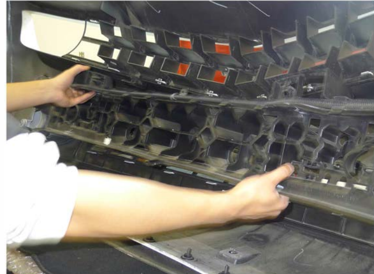
22. Remove the energy absorber