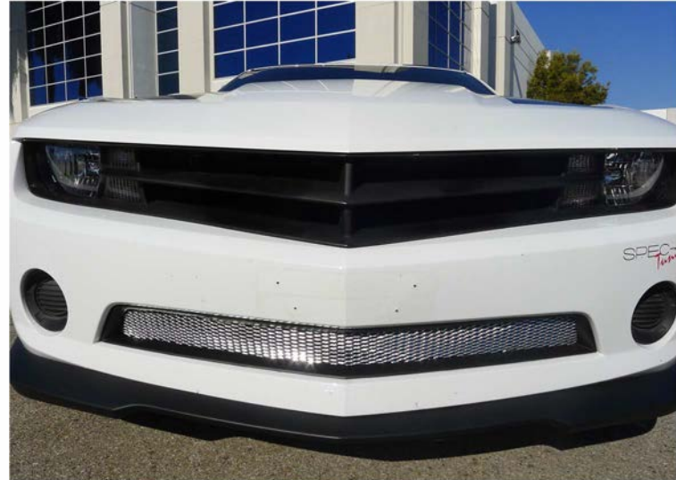
The installation now is complete