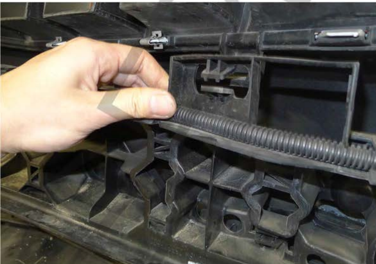
21. Release the (4) plastic retaining tabs