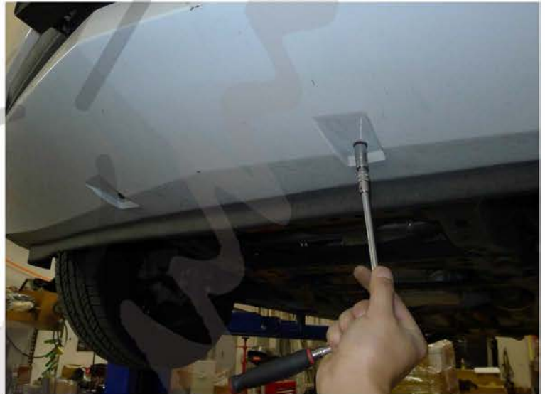
2. Remove the (2) 10mm bolts