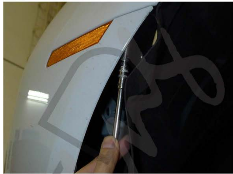
6. Remove the 7mm bolt