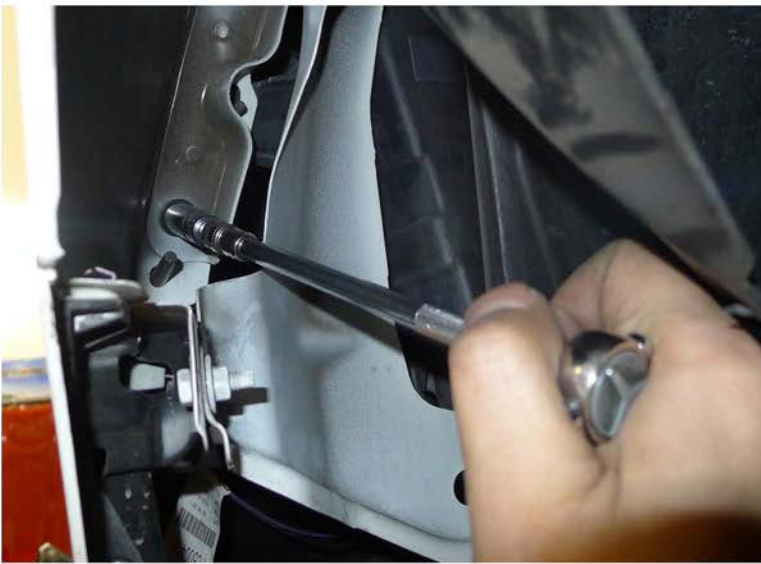
35. Tighten the (3) 10mm bolts