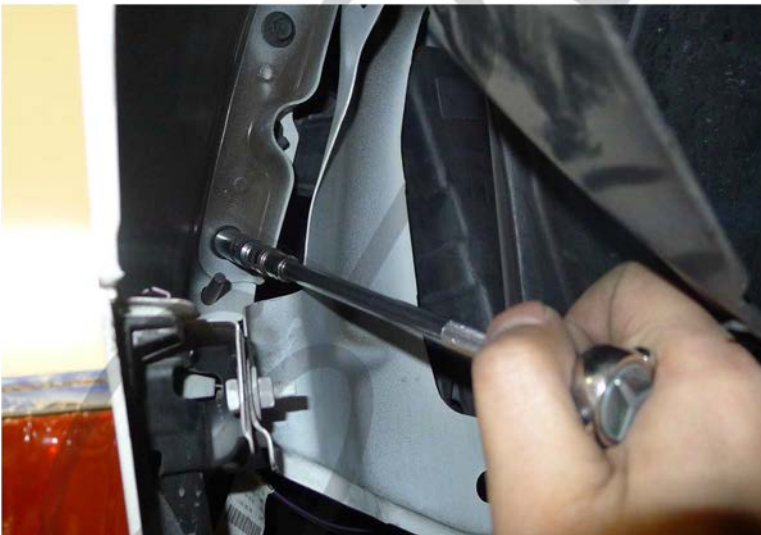
9. Remove the (3) 10mm bolts