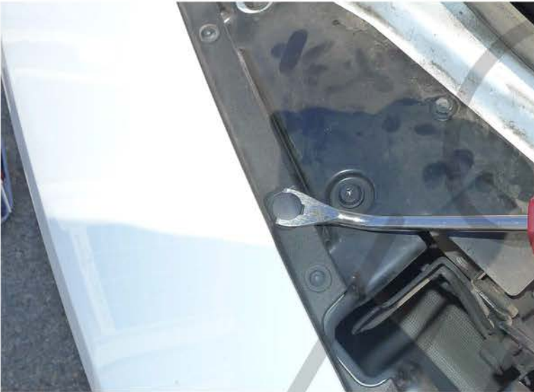
13. Remove the (6) plastic clips