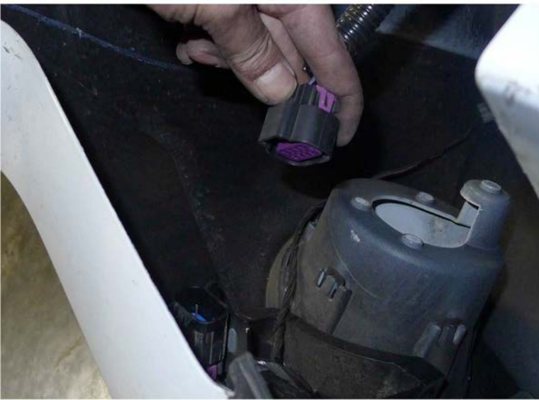
17. The 7mm bolt location