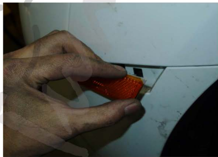
32. Replace the bumper light