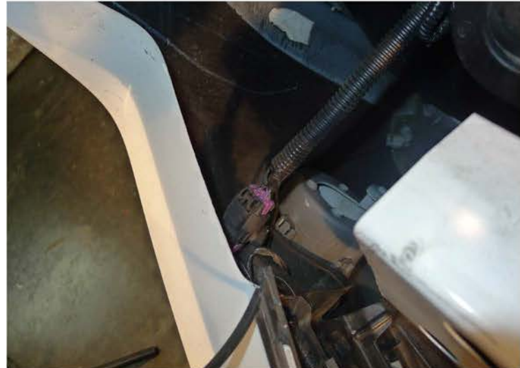
16. Electric harness connector location