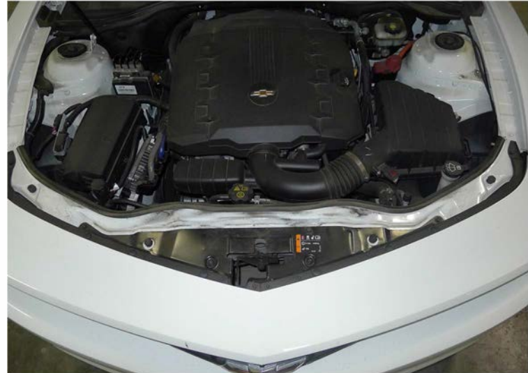
10. (2) 10mm bolts location