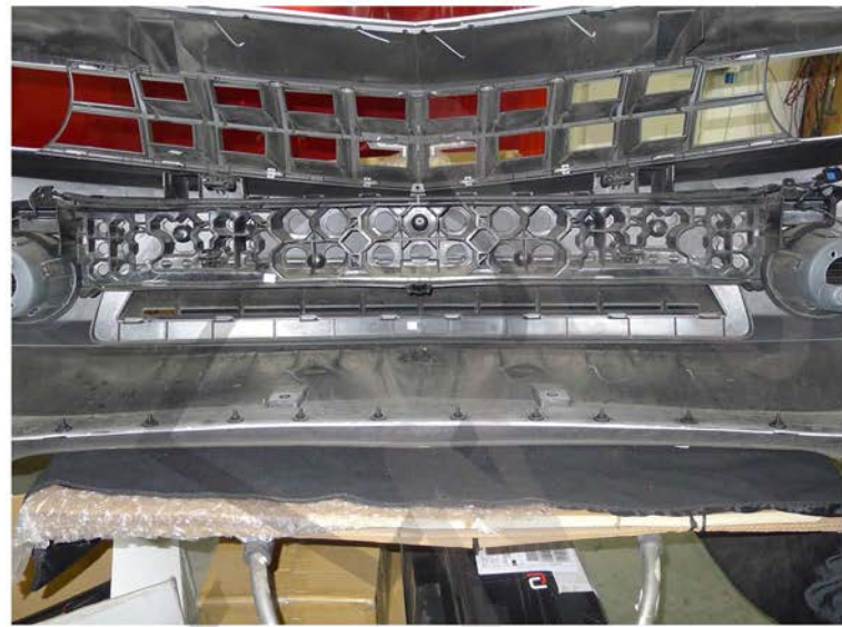
18. Behind the bumper