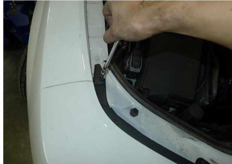
34. Tighten the (2) 10mm bolts