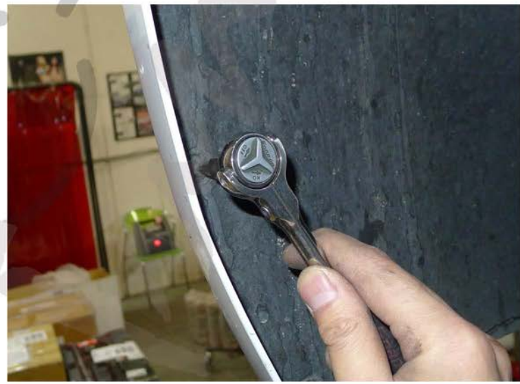
38. Tighten the (3) T20 screws