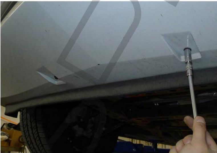
39. Tighten the (2) 10mm bolts