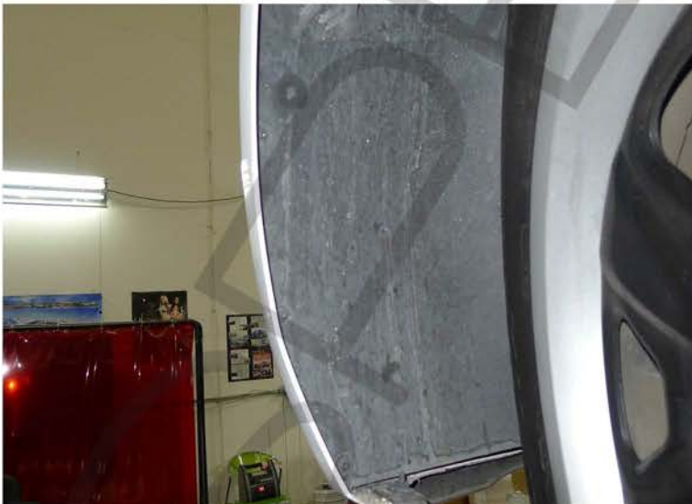
3. (3) T20 screws location