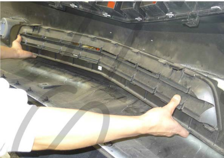
27. Remove the factory lower grill