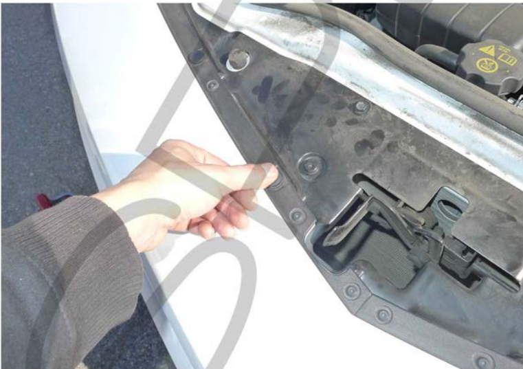
33. Replace the (6) plastic clips