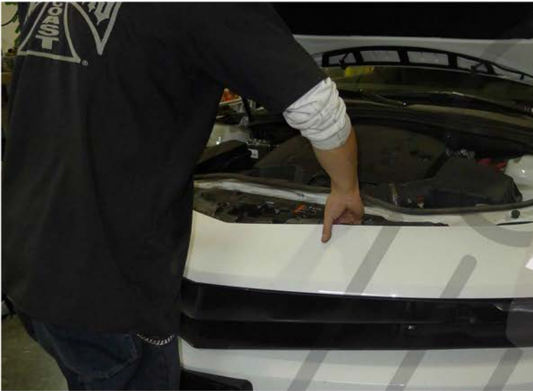
31. Replace the front bumper