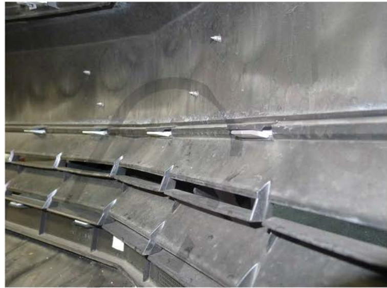
24. Lower grill mounting tabs