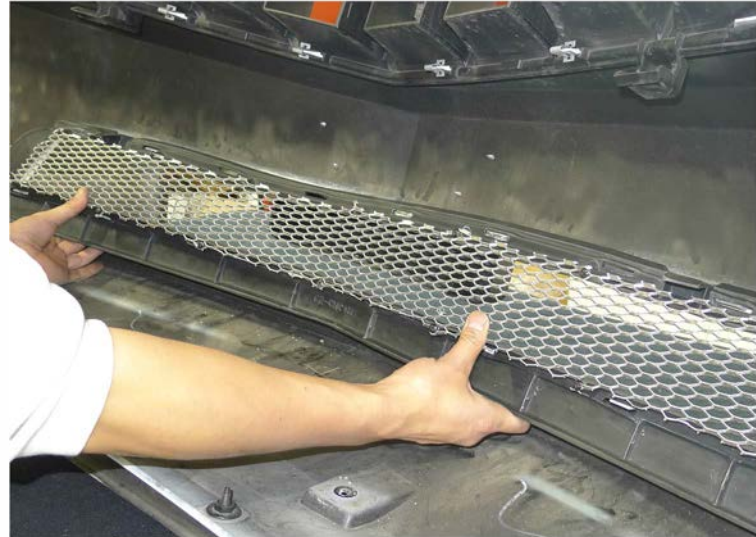
28. Install the new lower grill in the stock location