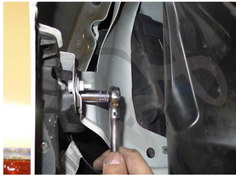
36. Tighten the 10mm bolt