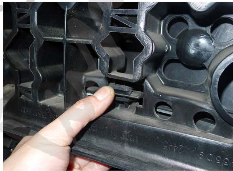
20. Release the (4) plastic retaining tabs