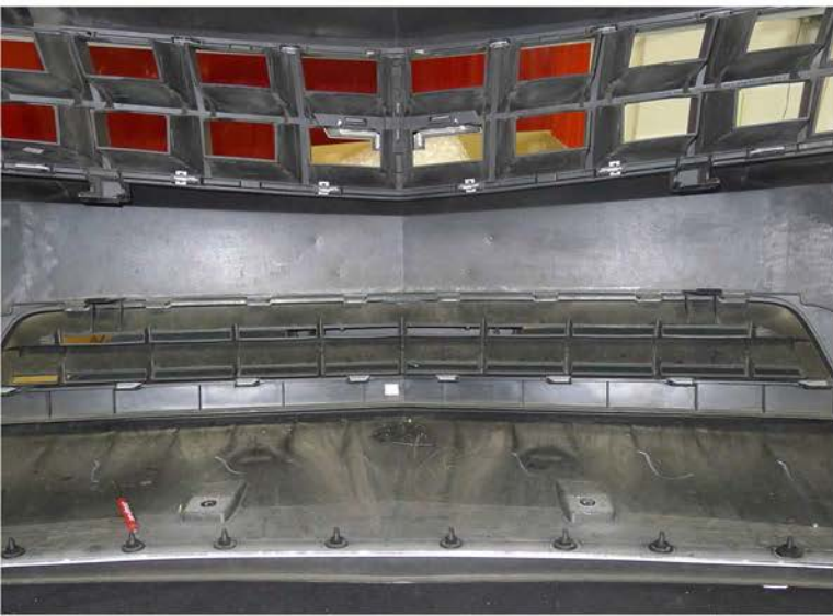
23. Back of the grill