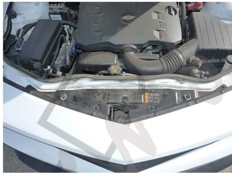
12. (6) Plastic clips location