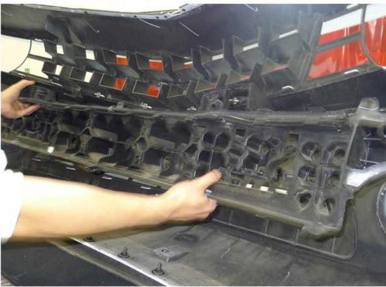
29. Replace the energy absorber