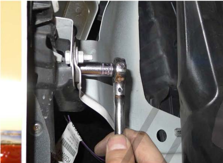
7. Remove the 10mm bolt