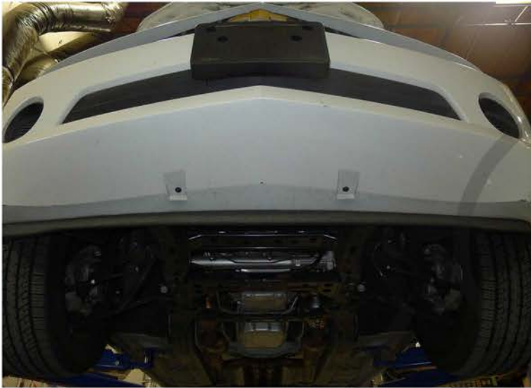
1. (2) 10mm bolts location

Do not make direct contact with the halogen bulbs or the wire assembly until the unit has cooled down after use.