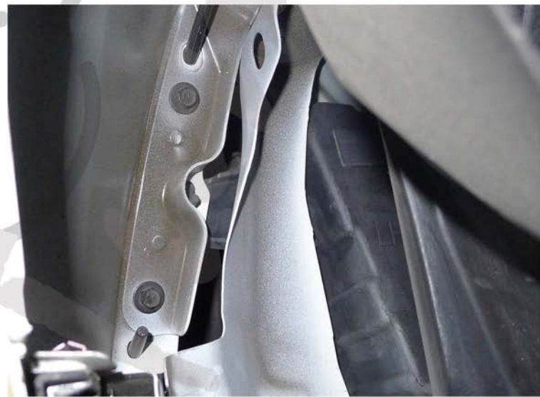
8. (3) 10mm bolts location