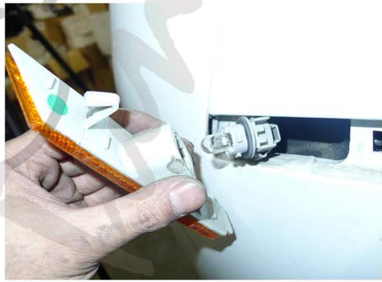
14. Remove the bumper light and disconnect the bumper light socket