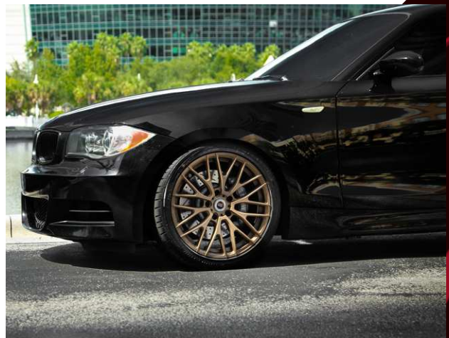
BMW 125i SP-20