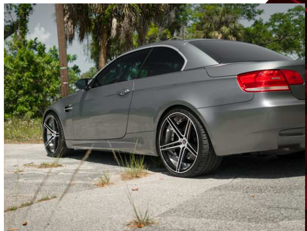
BMW M3 SPM-77