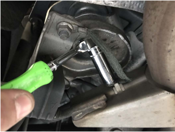
Pictured Left: Start by removing the exhaust grounding strap (13mm bolt) from the OEM Exhaust.