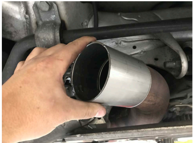
Pictured Right: Insert Torca clamps onto factory exhaust and insert SOUL exhaust pipes into the couplers. Try to ensure the clamp is distributed equally between the factory exhaust and SOUL exhaust.