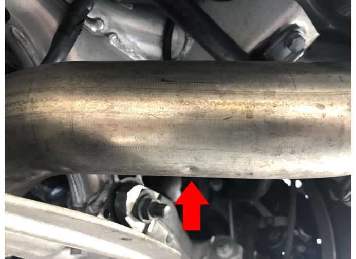
Pictured Right: Locate the OEM factory cut point / dimples on the underside of the exhaust