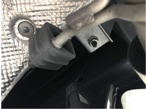
Pictured Left: Unbolt the factory exhaust hangers to release the factory rear mufflers from the car.