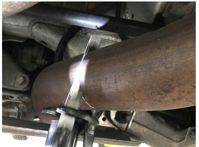
Pictured Right: Cut the exhaust tubing with the method of your choice. We recommend a reciprocating saw. Clean up any rough edges with sandpaper or a file.