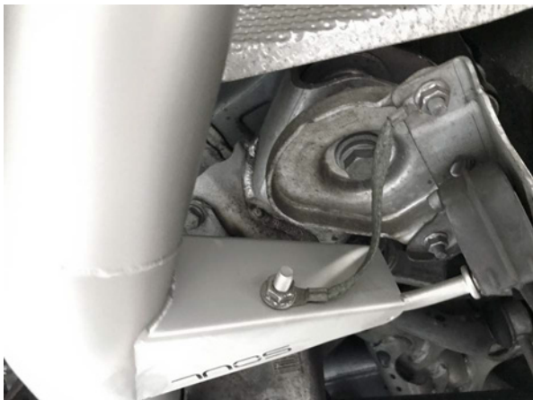
Pictured Left: Reattach the exhaust grounding straps.