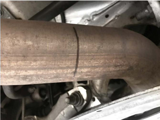
Pictured Left: We recommend drawing a straight line around the OEM tubing as a guide for a straight cut