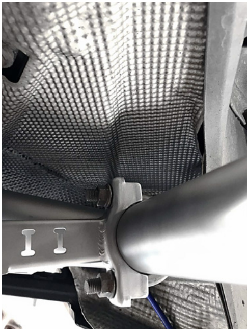
Pictured Left: Install the supplied U-Bolt and loosely tighten the 13mm nuts enough to leave room for adjustment later.