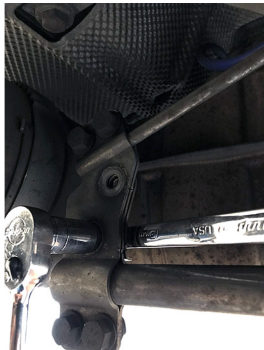
Pictured Above: Remove factory hardware from the rear mounting bracket. (Two) 13mm nut & bolt combinations per side.