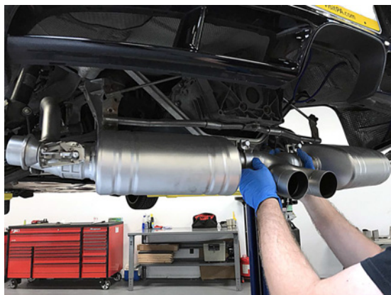
Pictured Above: With your new SOUL exhaust on the ground, install the center outlet "X" pipe as shown (13mm nut / bolt). Tighten the X-section's mounting clamps enough to provide rigidity to the left and right side mufflers, but not fully torqued yet. You can now lift the SOUL exhaust into place, you may need a friend or jack to help support the system.