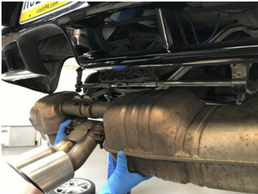
Pictured Left: Slide the exhaust rear and downwards to remove it from the car.

After removing the four bolts, the exhaust will not be supported. It helps to have a friend/jack to support the exhaust.