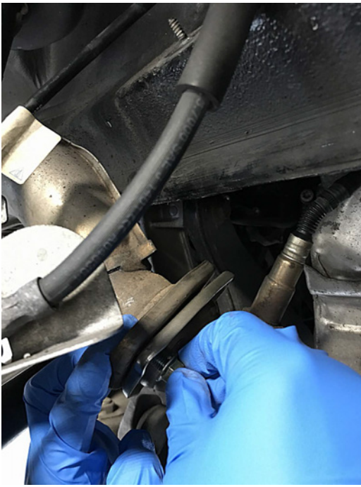
Pictured Above: Remove factory mounting hardware from the header / muffler flanges on both sides. In most applications these will be a 13mm nut / bolt combination.