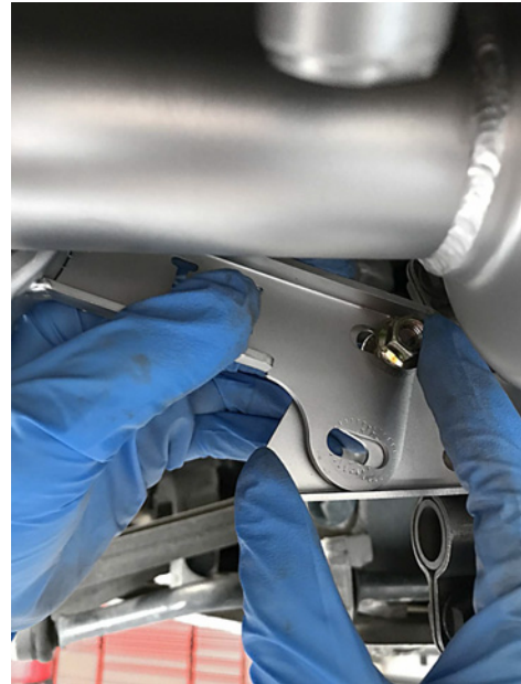
Pictured Left: Install the second, outer portion of the SOUL exhaust mount and loosely tighten the hardware (13mm nut/bolt)