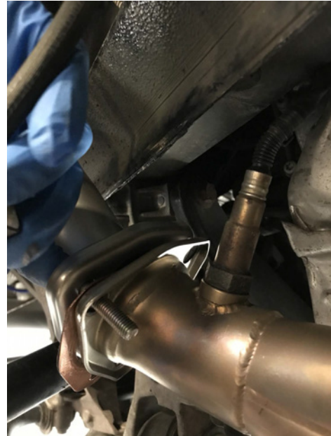
Pictured Left: If your factory gaskets are in good condition, apply a coat of Copper Seal and install them. Loosely install the three supplied nuts / bolts into the header/muffler flange. Leave them loose enough to allow for adjustment later.