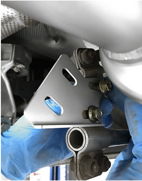
Pictured Above: Install and loosely tighten the first portion of the SOUL bracket (13mm nut/bolt)