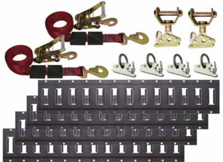
V6400 Low Clearance System

No one likes to lie on their back and crawl under the car to tie