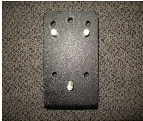
(87-06 YJ/TJ 5x4.5")