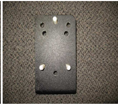
(07+ JK 5x5")

Step 2: Insert the bolts from the back side and thread outward and snug tight. (You may need to angle the bolt in between the bracket plates and then straighten it to thread it in.) Fig A