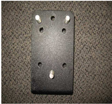
(41-86 CJ 5x5.5")

Step 1: Determine the correct lug bolt pattern you will need depending on the vehicle you have. (See Below)