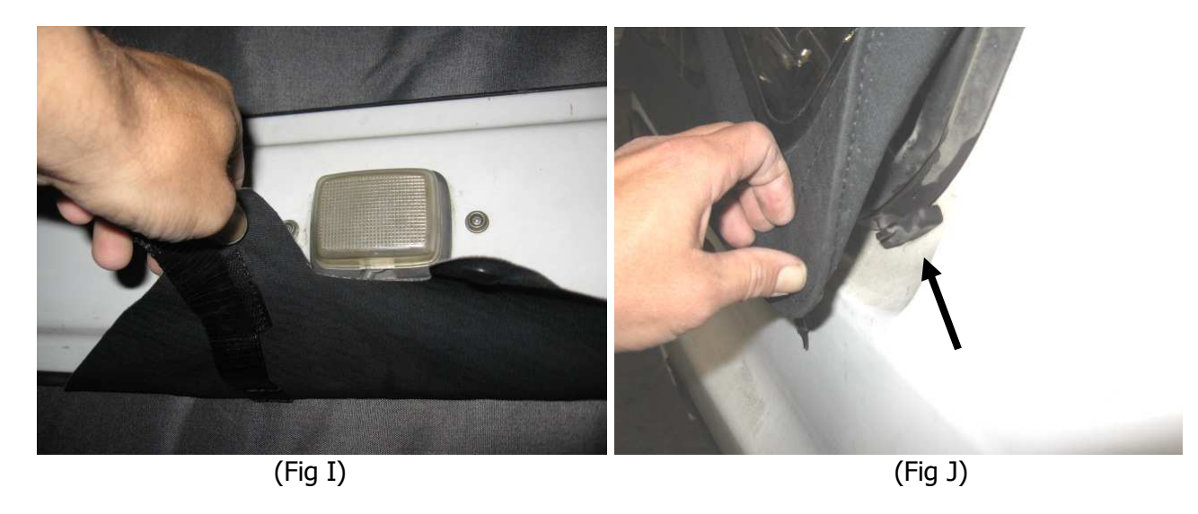
Step 9: Push the side windows back towards the vehicle and latching the retainer bar into the factory bracket located on the vehicle. Secure inside with retainer bar strap also. (Fig J, K)