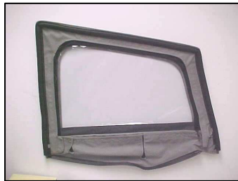
Driver Side Door Skin