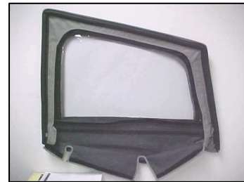
Door Skin Velcro Open