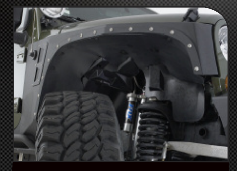
COMPLETE INNER LINER