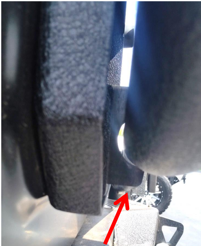
Incorrect adjustment. Tire swing is not securely in the saddle when tailgate is closed.

Note: It is recommended that you position your tire against the tire swing frame so that when you tighten the lug nuts it compresses the tire against the tire swing. This prevents the sidewall from flexing and creating a vibration.