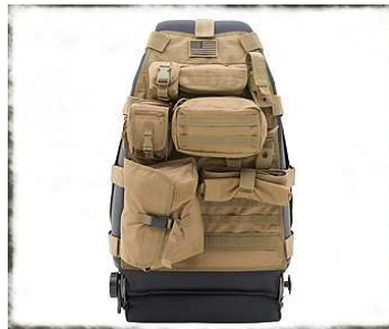
GEAR Seat Covers