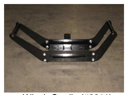
Winch Cradle (#2811)