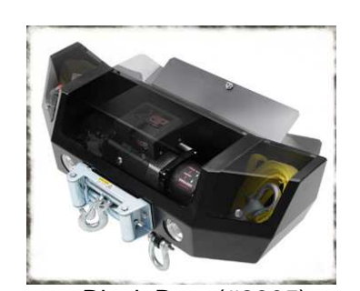
Black Box (#2805)