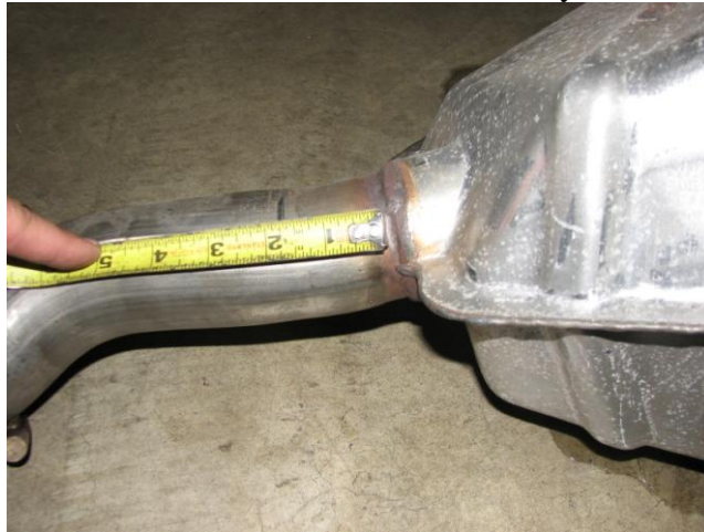
Figure 1: 1.75" from weld on rear muffler