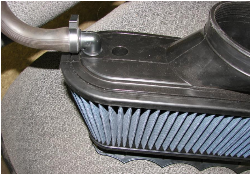
0.75" diameter hole for AIR pump (if equipped)