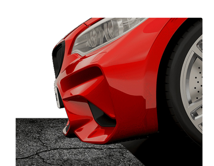
Steep Driveway Bumper Scrape Damage

In the end, I took a plunge and tested my first batch using adhesive as a starting point. In the beginning, delamination and adhesive failure were issues that kept me up at night. However, after some relentless long days and nights, I stuck to the job in hand and eventually found the perfect combination of super strength adhesive, teamed with the correct processing of the polyurethane, to make it all stick together. It was at this moment that I knew I had a real product on my hands.