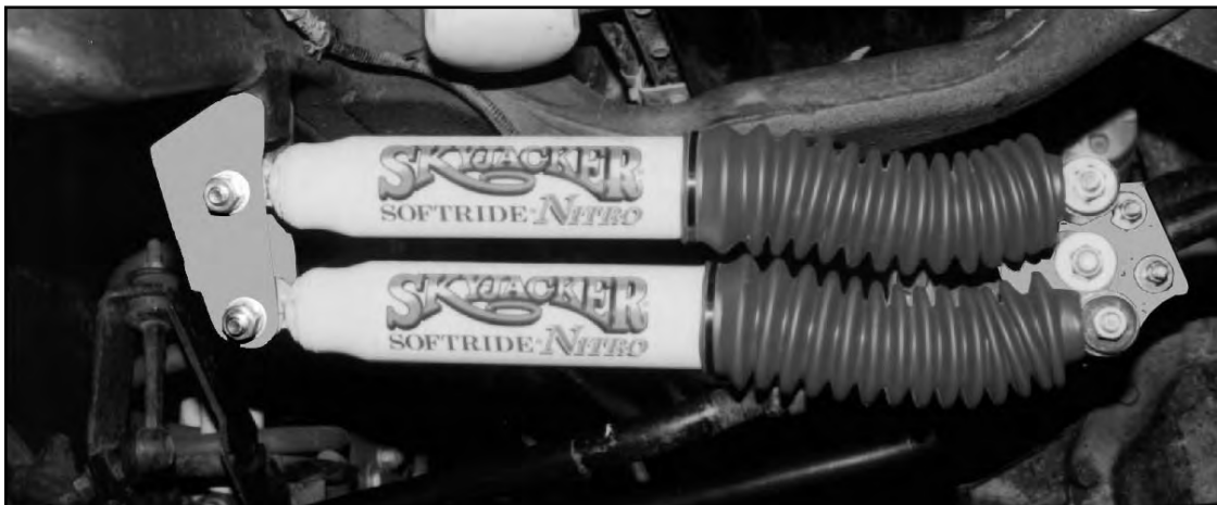
Dual Steering Stabilizer Available, #7217