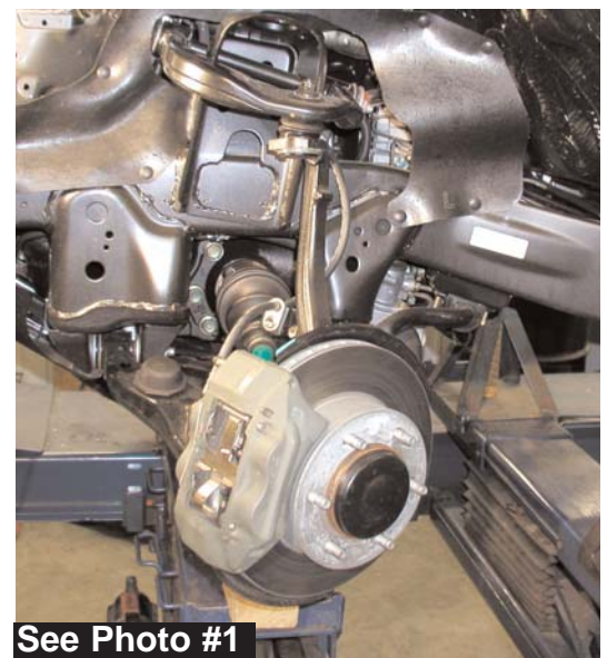
See Photo #1