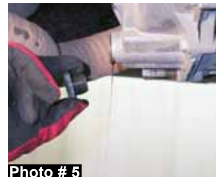
Photo # 5