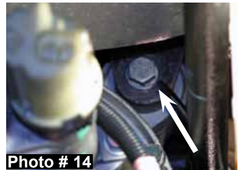
REAR mounting point on passenger side diff tube.