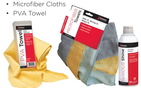
Frequency: Every Trip for Best Results