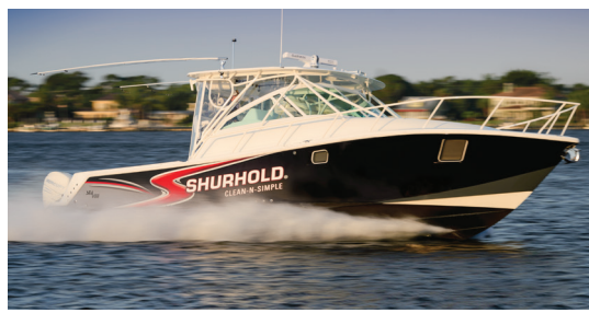
MARINE | AUTO | RV