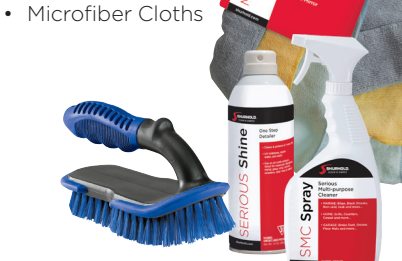
Frequency: As Needed