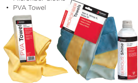
Frequency: Every Trip for Best Results