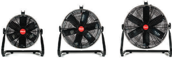
11 in. Diameter