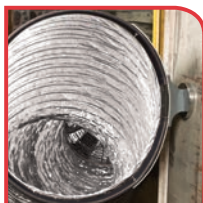
Magnetic hose end mounting bracket.