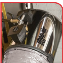
Air circulating mounting bracket.

Provides continuous air circulation. Cools down hot trailers by forcing the cool air in and warm air out. The unique mounting bracket lets you easily mount the fan near any loading dock, clear of forklift traffic. With magnetic hose end mounting bracket, you're free to position the air duct hose anywhere within the dock door.