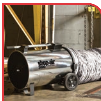
Flexible air duct hose that extends to 25 ft.