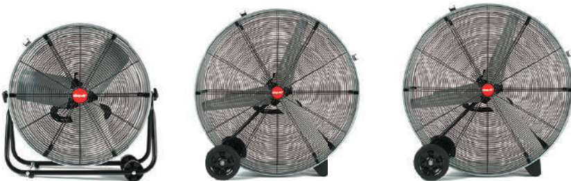
24 in. Diameter