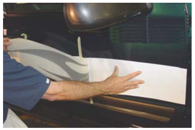
3. Remove the positioning tape on either side of the center hinge from the graphic and peel the liner paper away from this portion of the graphic. Lightly tape the graphic to the vehicle surface (as illustrated in Step 4).