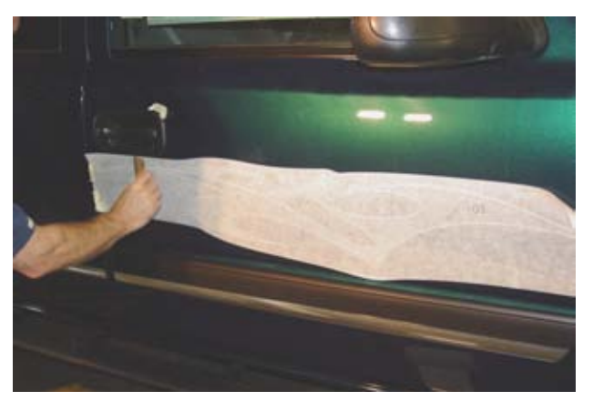
8. Squeegee the remaining half of the panel onto the vehicle using the same method as outlined in Step 6.