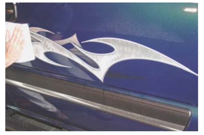
10. With the adhesive weakened, is will be easier to remove the masking by pulling the masking away from the application surface at a 180 degree angle. If the premask is plastic, carefully pull it away from the application surface at a 180 degree angle.