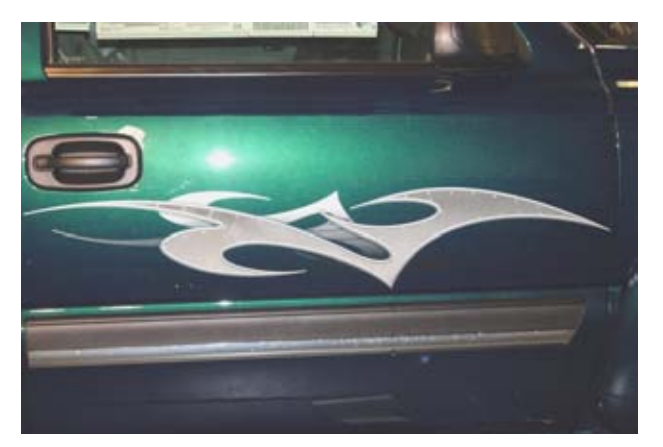
9. Gently wipe away any remaining application fluid and carefully examine the graphic to make sure no bubbles remain under the surface of the graphic.