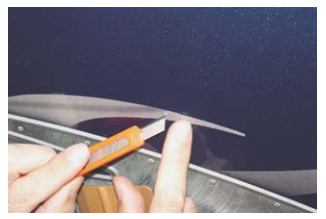
10. If any small bubbles appear during installation, they can be easily removed by pricking the base of the bubble with the knife blade and squeezing any trapped solution out with the tip of your finger.