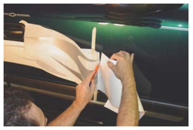
4. Temporarily secure the end of the graphic to the vehicle surface and cut the backing paper off near the center hinge using a sharp knife blade.