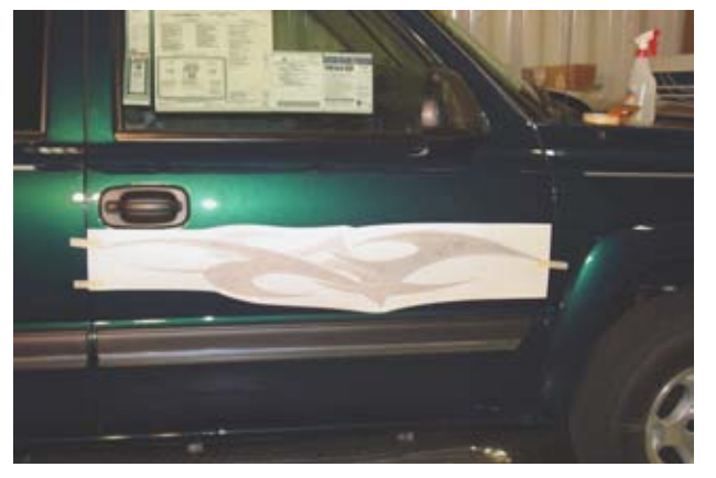
1. Tape the graphic onto the side of vehicle to determine exactly where you want the graphic installed.