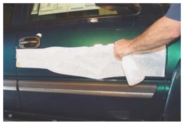
9. If the graphic has a paper premask covering it, thoroughly wet the surface of the masking with the application solution and wait a minute or two. The liquid will help break down the masking's adhesive.