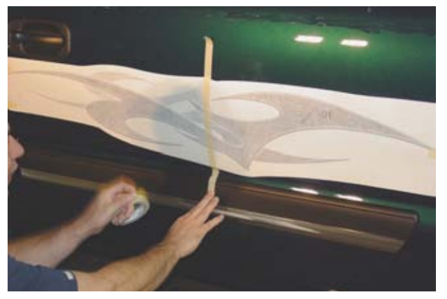
2. Apply a strip of tape vertically through the center of each component and lightly tape each end of the graphic panel to the vehicle.