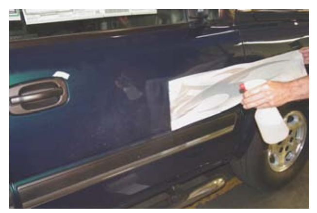
7. Remove the tape hinge from the center of the graphic. Remove the remaining backing paper and spray the Easy On^{TM} solution on the application surface.