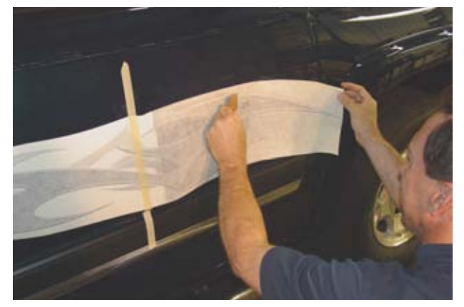
6. Lay the graphic onto the wet application surface and firmly squeegee the graphic using short, overlapping strokes.