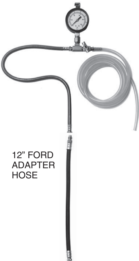
12" FORD ADAPTER HOSE