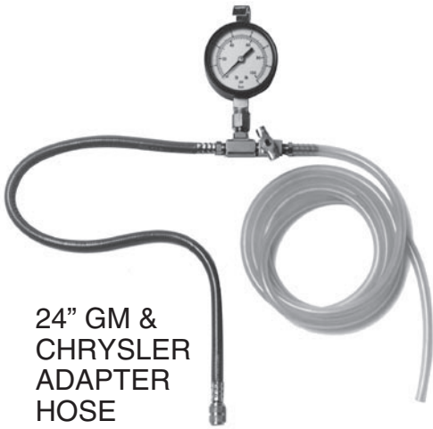
24" GM & CHRYSLER ADAPTER HOSE