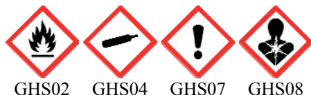
GHS02 GHS04 GHS07 GHS08