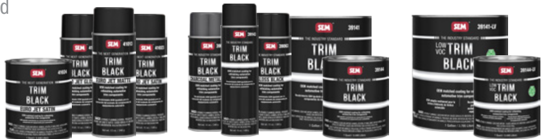
EURO JET BLACK