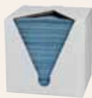
3835( ) PLASTIC & LEATHER PREP & lint free towels