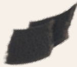
39362 SEM SOAP & gray scuff pads