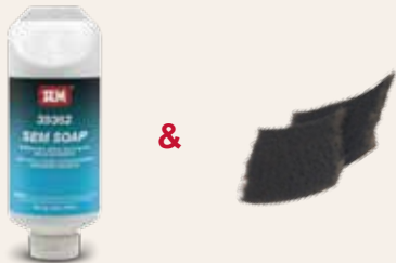
39362 SEM SOAP & gray scuff pads