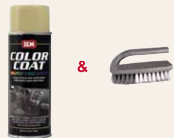
COLOR COAT & a nylon bristle brush