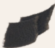
39362 SEM SOAP & gray scuff pads