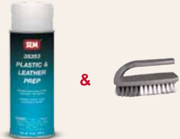
3835( ) PLASTIC & LEATHER PREP & a nylon bristle brush