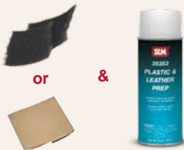
Gray scuff pads or 400-600 grit sandpaper & 3835( ) PLASTIC & LEATHER PREP.