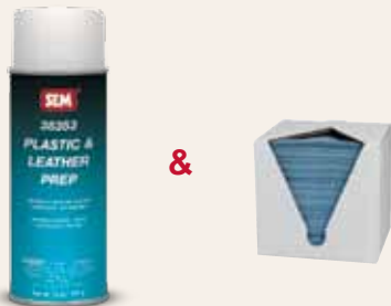
3835( ) PLASTIC & LEATHER PREP & lint free towels