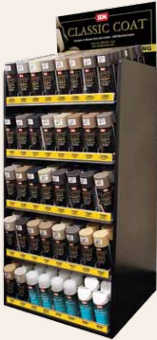
17002 CLASSIC RACK ASSORTMENT

CLASSIC COAT™ offers 35 factory-matched OEM colors from Ford, GM, Chrysler, Honda, Toyota, Acura & BMW