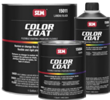
MIXING SYSTEMS THOUSANDS OF OEM MATCHED COLORS

Flexible Plastic | Rigid Plastic | Vinyl | Carpet | Velour & More