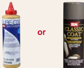
SURE-COAT™ or CLASSIC COAT™