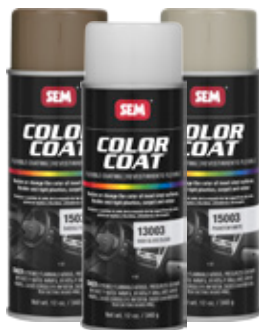
50 POPULAR AEROSOL COLORS & 3 CLEARS