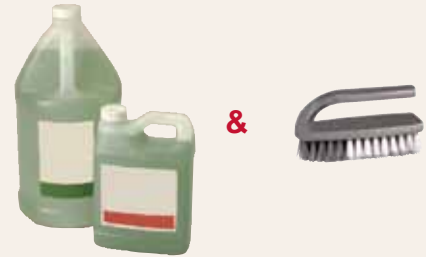
Upholstery shampoo or carpet shampoo & a nylon bristle brush