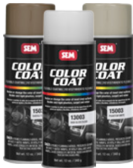
50 POPULAR AEROSOL COLORS & 3 CLEARS