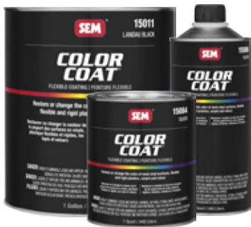
MIXING SYSTEMS THOUSANDS OF OEM MATCHED COLORS

Flexible Plastic | Rigid Plastic | Vinyl | Carpet | Velour & More