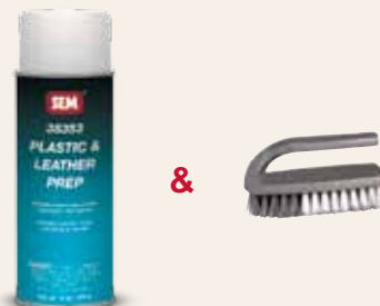
3835( ) PLASTIC & LEATHER PREP & a nylon bristle brush