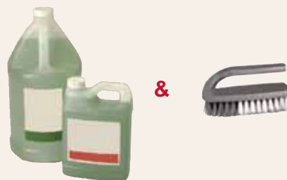
Upholstery shampoo or carpet shampoo & a nylon bristle brush