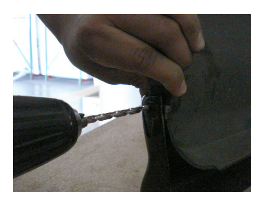
Fig. 6 Align drilling points with existing mounting points on the bumper. Drill through carbon only. Use your best judgment to secure the lip for the best fitment possible.