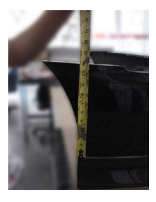
Fig. 5 After adjustments are made, properly align the lip onto the bumper. Measure both ends, make sure they are of equal heights and that the lip is snug. Keep lip in place with masking tape.