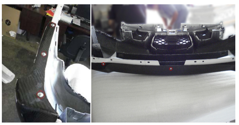
Fig. 8 Use previous steps in fig. 6 and 7 to complete installation. Once all screws are in place, finish your installation by tightening all the screws.