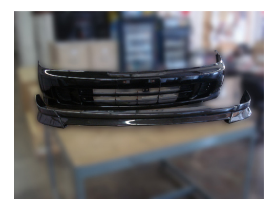
Fig. 1 Remove the bumper and place lip onto the bumper. Do not force the lip onto the bumper. Pay attention to the fitment to figure out what modification will be needed for installation.