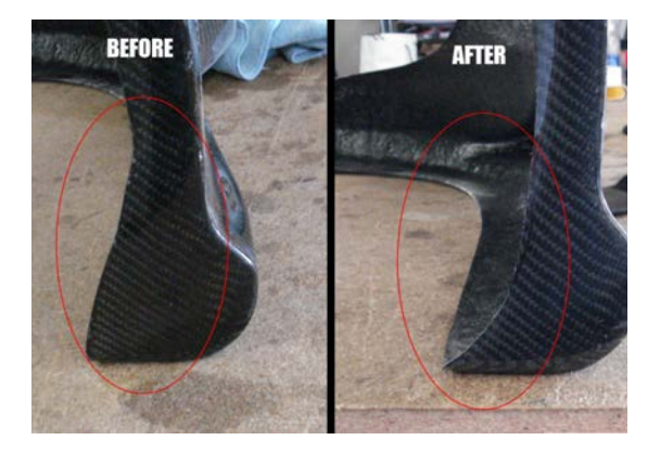
Fig. 3 Shaving and/or shaping might be required for proper fitment in various areas. Not all lips will require this step.