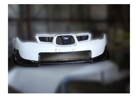
Fig. 9 Do a visual inspection and make any final adjustment as necessary.