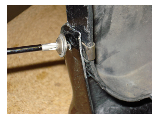
Fig. 7 Install the screws but don't completely tighten them yet. Leave room for adjustments if needed.