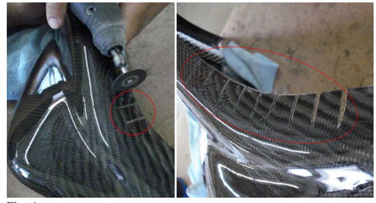
Fig. 4 Stress cuts can be used to relieve/prevent cracking during and/or after installation. Pictures above are an example of how the cuts can be made with dremel cutting wheel.