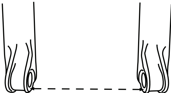
STEP 2 - measure the distance between the forks.