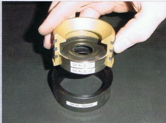
Step 1 – Place axle seal housing into counter bore of seal guide.