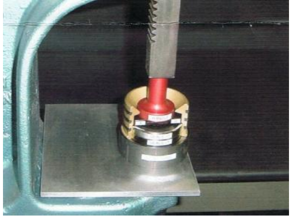
Step 6 – Place on flat surface in arbor press. Push old insert seals into seal guide.