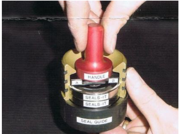
Step 5 – Assembly ready for arbor press.