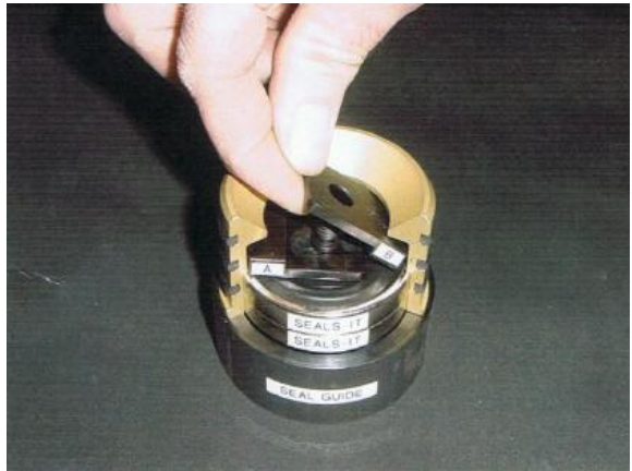
Step 3 – Place jaw B in cavity over screw.