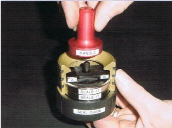
Step 4 – Screw handle onto jaw A stud until tight.