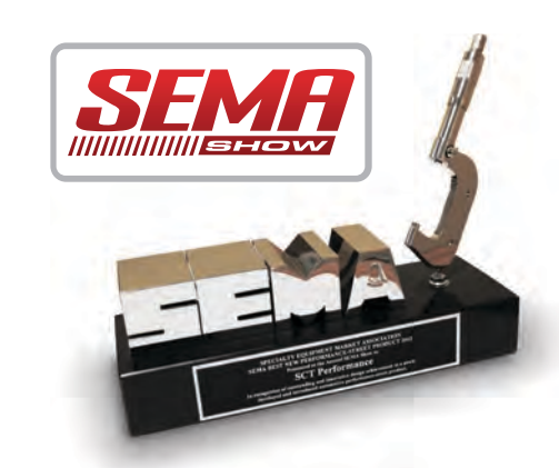
2012 SEMA BEST NEW PERFORMANCE PRODUCT AWARD WINNER

NOT LEGAL FOR SALE OR USE IN CALIFORNIA ON POLLUTION CONTROLLED VEHICLES.