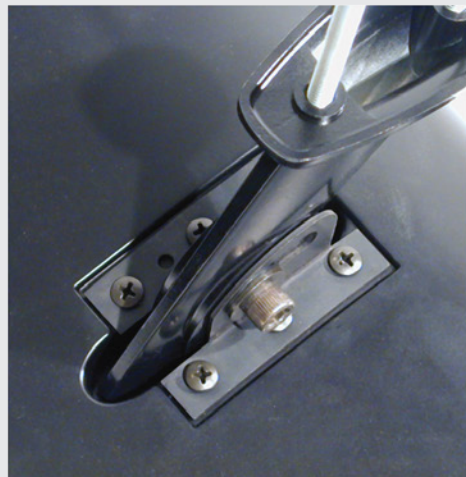
Inside mounting plate