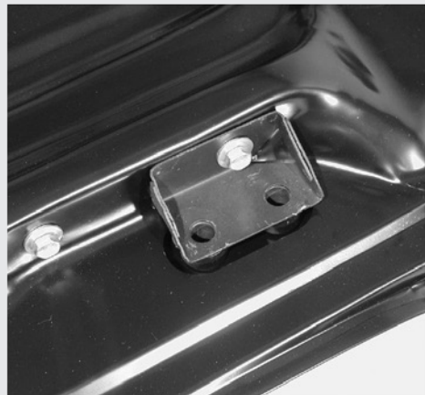
Reinforced plate C9ZZ-6344220-B Not included but sold separately if concurs installation required.