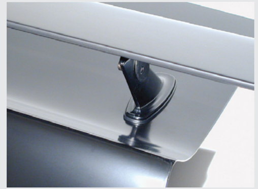
Bolted on and perfectly aligned

f) Adjust wing angle by loosening both Allen head bolts, adjust angle to desired position and re-tighten bolts.