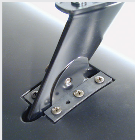
Outside mounting plate

C) The hard way is the way that is explained here. The problem with the above is that it leaves too much in the way of slop in mounting the wing. Most restorers want things to be more precise and perfect than what the above process allows.