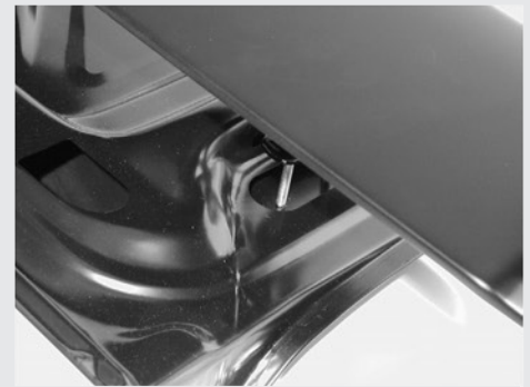
Aligning wing to underside of deck lid