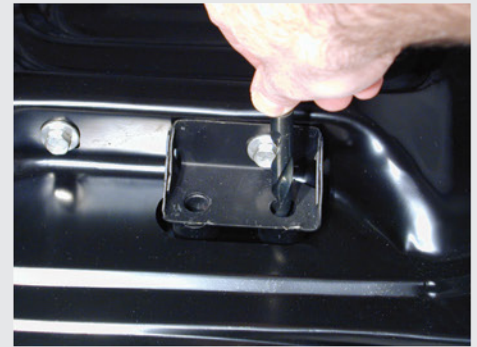
Marking Center with drill bit