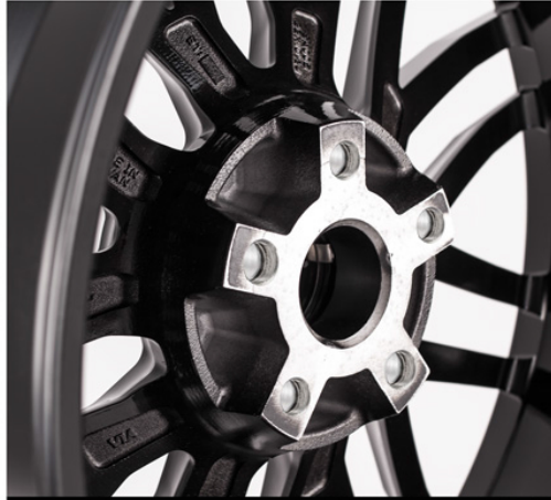
BACK PAD WEIGHT REDUCTION