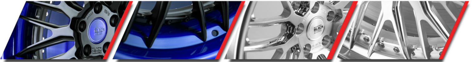
BRUSHED HIGH POLISH