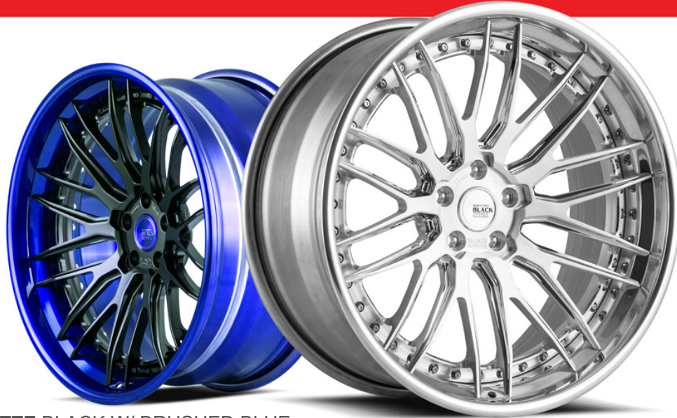
MATTE BLACK W/ BRUSHED BLUE