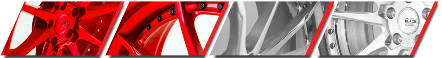
BRUSHED HIGH POLISH