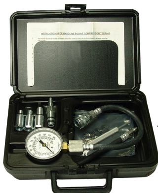
33875 Molded Storage Case