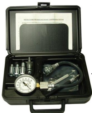
33875 Molded Storage Case