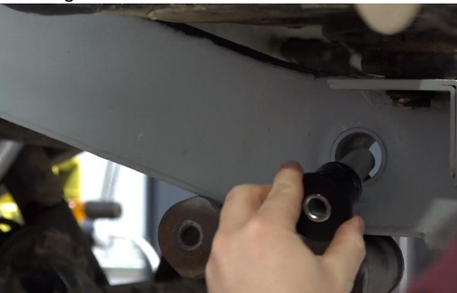
Using two 19mm sockets, rotate the shackle into place, send the bolt through, and secure the nut onto it. Reinstall your gas tank, cords, and tubes.

Begin reassembling your vehicle by resecuring your spring shackle and mount. Insert a new bushing according to the manufacturer's instructions.