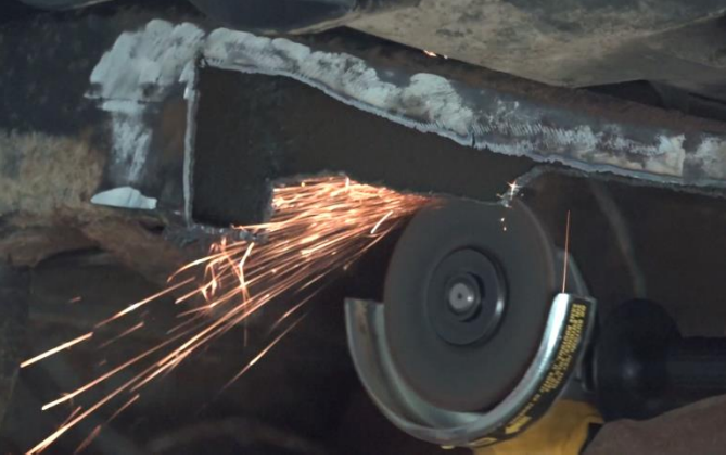
Tack weld and/or clamp the part into place.

Once the part has been fitted, prepare your weld zones by clearing away any rust or debris, revealing bare metal.