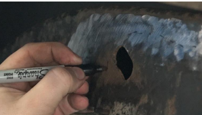
Continue to draw the line around to the inside of the frame, following the gas tank support, 1.5" from it and the top edge.

Hold the Rust Buster part up to the frame and take note of its measurements. Using a grinding wheel, grind the zone down to bare metal as best as possible. Measure 1.5" from the top of the vehicle's frame and draw a line, tracing the edge. Draw a second perpendicular line just left of the left most slot.