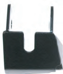
LH Side Passenger