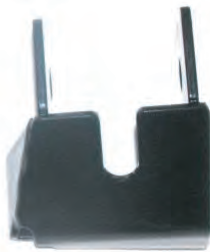
RH Side Driver