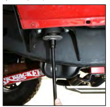
Step 5. Once all the nuts have been tightened, tighten the center bolt of the body mount to 80-ft/lbs. Repeat for each mounting location.

Step 1. Locate the four (4) body mounts at the rear of the front wheel well, and in front of the rear wheel well (two mounts per side). Start by removing the 18mm center body mount bushing bolts on each body mount (some force may be required).