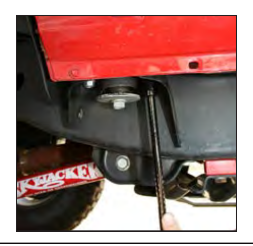
Step 6. Installation is now complete.