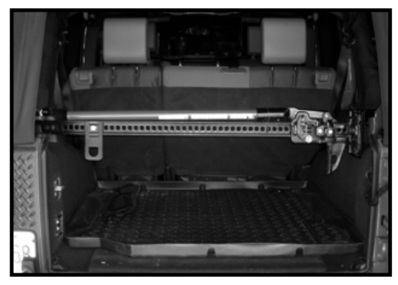
Page 2 of 2

5. Adjust the bracket so that the jack is in the horizontal position. Fully tighten all nuts and wing nuts and check for interference.