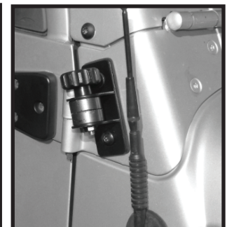
TJ-LJ Install pic.9

Step 7. When doors are reinstalled remove mirror arm from bracket. Place bushings back into arm. Tighten knob. (pic.8-9)