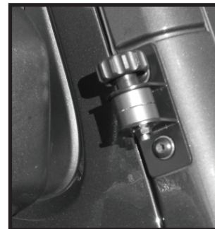
JK Install pic.8

NOTE: TJ applications are designed to be used with doors off. Some visibility on passenger side will be blocked if used with doors.