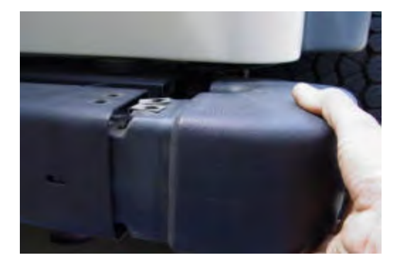
For some 97-2006 Wranglers the rear body mount and bolt may need to be removed to gain access to the top inside rear bumper bolt.