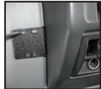
Step 4 & 5

Step 4: (Optional CB Mic Mount) If CB mic mount is to be used remove the Phillips head screw located to the right of the steering wheel. Use (2) M4 bolts and nuts to secure CB mic holder to bracket (mic bracket not supplied) This bracket should be supplied with CB. New mic bracket mounting holes may need to be drilled if holes do not line up.